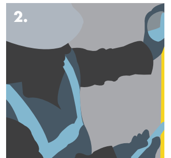
Marking position for the Knauf Universal Bracket.

Generate specifications at www.knauf.co.uk