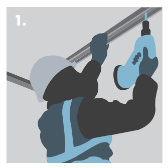
Fixing Knauf 'U' Channel – Perimeter Support to the soffit.

Fix the intermediate Knauf Universal Brackets to the background, at the marked positions, using fixings appropriate for the background.