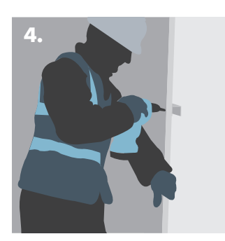
Fixing Knauf Plasterboard to the Knauf 'C' Channel.