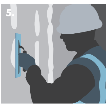
Applying Knauf Plasterboard Adhesive around the perimeter and at the required centres.