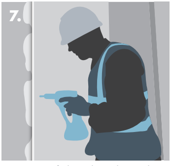
Fixing Knauf Plasterboard onto the Knauf Metal Furring Channel.