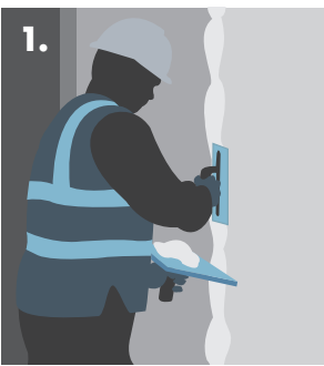
Applying a continuous band of Knauf Plasterboard Adhesive around the perimeter.