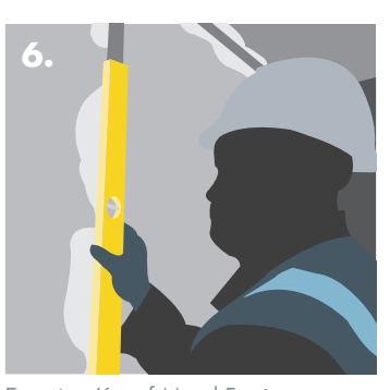
Ensuring Knauf Metal Furring Channels are fixed plumb.