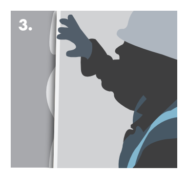
Offering up Knauf Plasterboard and pressing into place.