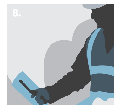
Finishing using Knauf Plaster.