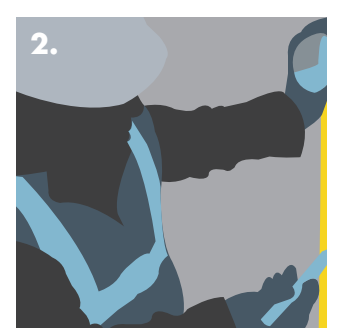
Marking position for the Knauf Universal Bracket.