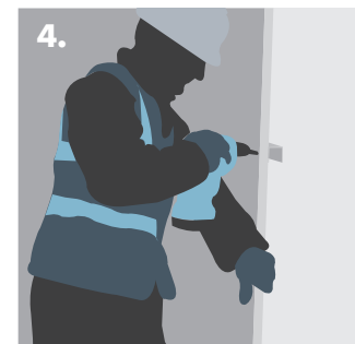
Fixing Knauf Plasterboard to the Knauf 'C' Channel.