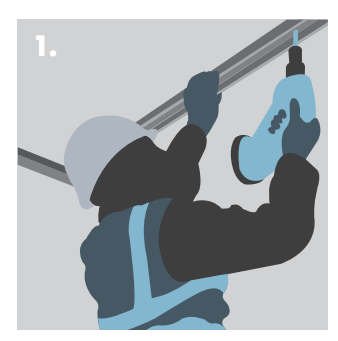
Fixing Knauf 'U' Channel – Perimeter Support to the soffit.

The plasterboard lining is fixed by screwing into the metal framework, using Knauf Screws at 300mm centres. Reduce to 200mm at corners. Fixings should be to all horizontal and vertical members.