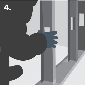
Twisting Knauf 'I' Studs into position.