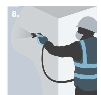
Finishing using Knauf plaster.