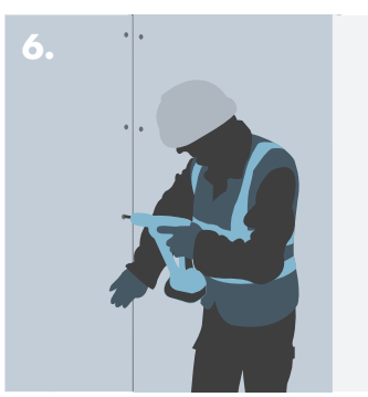
Fixing Knauf Soundshield Plus to the frame.