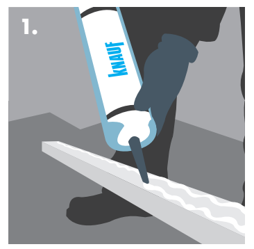
Applying two continuous beads of Knauf Sealant to perimeter framing.