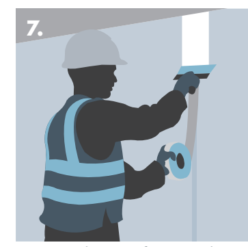
Taping and jointing for a seamless finish.