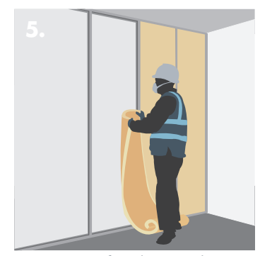
Inserting Knauf insulation quilt between the Knauf 'C' or 'I' Studs.