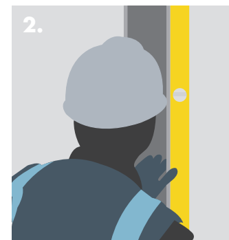
Fixing Knauf 'U' Channel to form the partition frame.