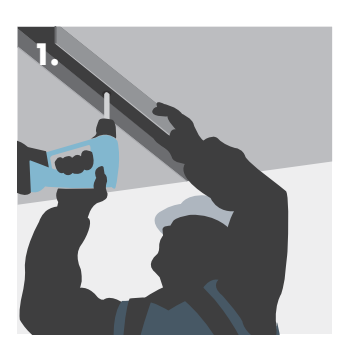
Fixing Knauf 'J' Channel to the soffit

When constructing a firefighting lift shaft, Knauf Performance Plus is used, as it is highly durable and able to withstand the effects of impact and water, to which it would be subjected during a fire, without losing its fire resistance or integrity when tested to BS 9999: 2008. This means that fire crews maintain protected access to all floors within the building.