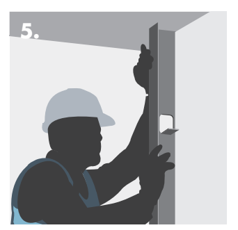
Knauf 'J' Channels are used vertically at corners and abutments.