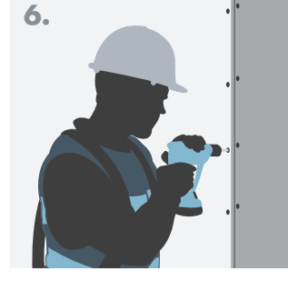
Fixing Knauf Fire Panel.