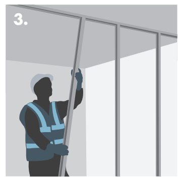
Twisting Knauf ^\prime C^\prime Stud into position.