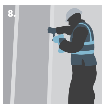
Fixing Knauf Plasterboard to the completed framework.