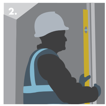
Fixing Knauf 'C' Stud to form the partition frame abutment.