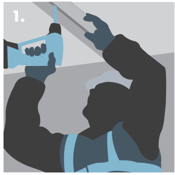
After fixing the head track, the floor track should be positioned by using a vertical stud and a laser/spirit level.