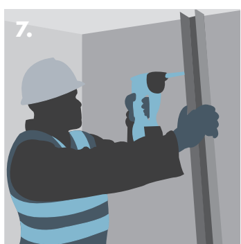
Fixing Knauf Deep Flange 'U' Channel to studs at door opening.