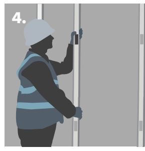
Adjusting the stud position.