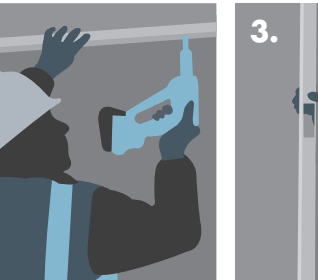
Installing head track.

Studs should be positioned within the channels to coincide with the abutments of the boards, which will be fixed later. The centres (either 300, 400 or 600mm) depend on the performance requirements. In general, there is no requirement to secure the metal at this point as this will be achieved once the boards are screw fixed.