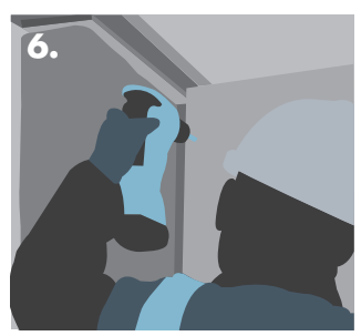
Fixing Knauf Plasterboards to complete the lining.

Knauf 'l' Studs should be trimmed to within 5mm of the slab to soffit height. Extend the length of Knauf 'l' Studs where necessary by splicing the Knauf 'l' Studs with Knauf Deep Flange 'U' Channel. See detail 30, page 40 (Performer).