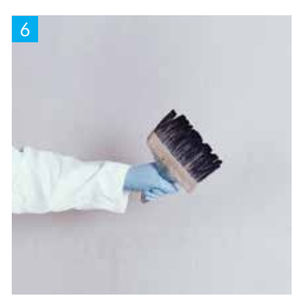
Applying Knauf Wallboard Primer for Tape & Jointing system only.