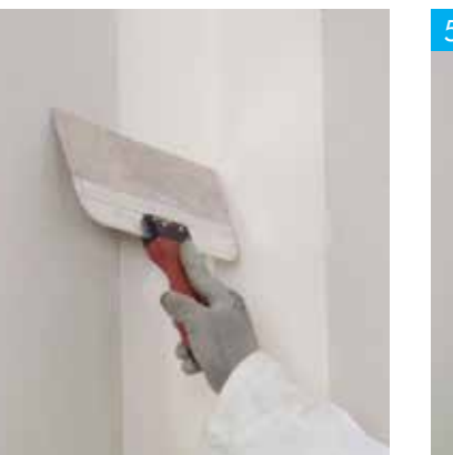
Apply Knauf Joint Cement Premium finish coat to 75mm each side.