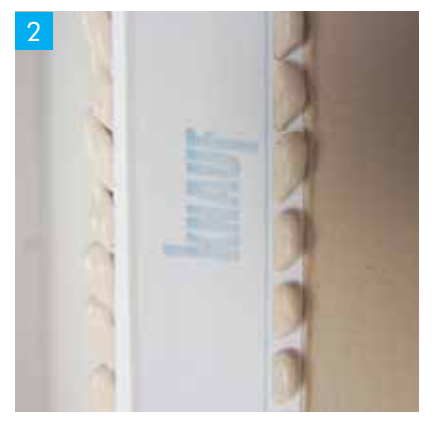
Ensure all holes are completely filled.