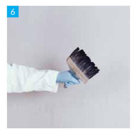
Sand to a seamless finish and apply Knauf Wallboard Primer for Tape & Jointing system only.