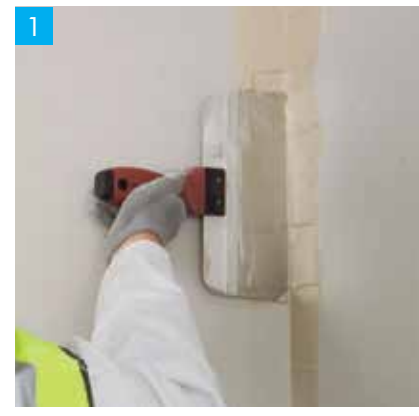
Ensure the joint is completely filled.