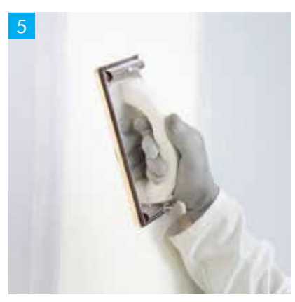
Sand to a seamless finish.