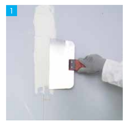
Applying Knauf Joint Filler Premium to either side of the corner.