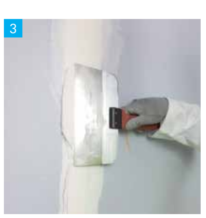
Applying first coat of Knauf Joint Cement Premium.