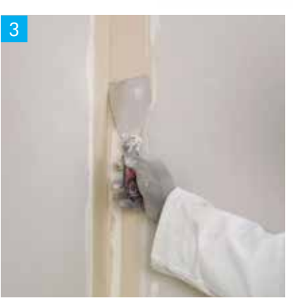
Cover to a width of 50mm each side of the joint.