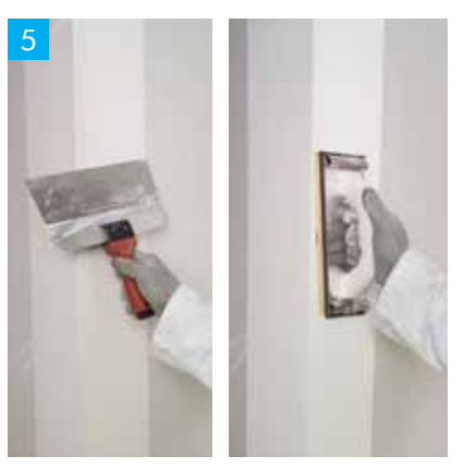
Applying the finish coat of Knauf Joint Cement Premium.