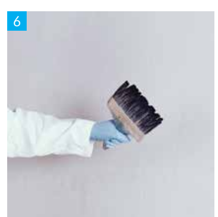
Applying Knauf Wallboard Primer for Tape & Jointing system only.