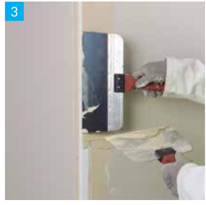
Applying the first layer of Knauf Joint Filler Premium.