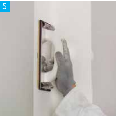
Sand to a seamless finish.