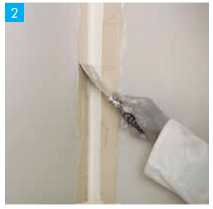
Bedding Knauf Joint Tape.