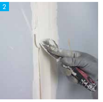
Bedding Knauf Joint Tape.