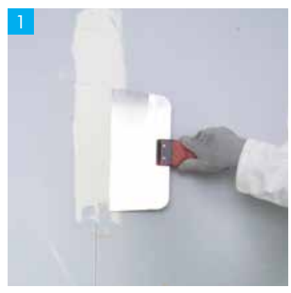
Applying Knauf Joint Filler Premium.