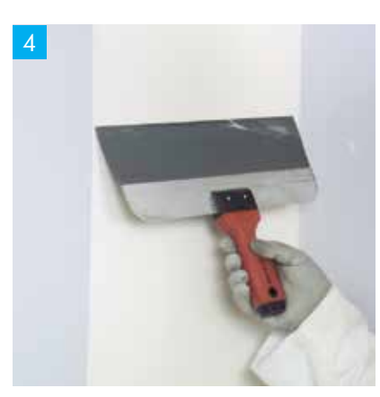
Applying the second coat of Knauf Joint Cement Premium.