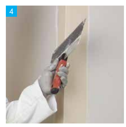
Apply second coat to 175mm each side of the corner.